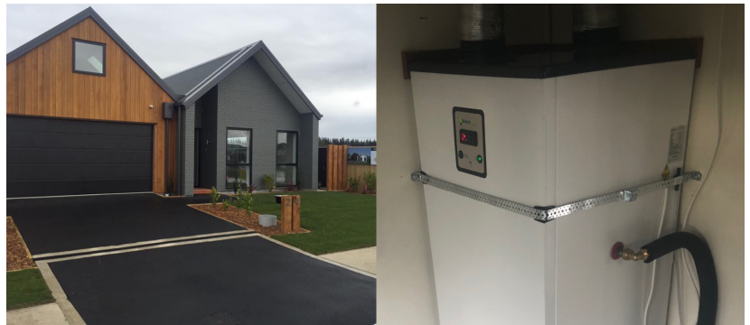
Indicative running costs and savings of water heating options* 4 person family

Clients comments – "We put the Green E Cylinder in when Building because we wanted to be greener. Compared to our last house we are saving around $100 a month on hot water heating costs"